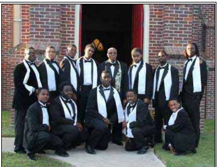
St. Mary's Homecoming Eucharist featuring the Jubilee Singers , September 9<sup>th</sup>, 4:00 pm.

Sunday, September 29 Eucharist, 8:30 & 11:00 a.m. Sunday School, 10:00 a.m.